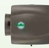
HCWB3-12 Bypass Humidifier 12 gallons per day