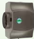
HCWB3-17 Bypass Humidifier 17 gallons per day

Bypass Humidifiers work in conjunction with your HVAC system, using the air handler or furnace fan to direct humidified air throughout the home.