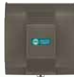
HCWP3-18 Power Humidifier 18 gallons per day

Equipped with a built-in fan, a Power Humidifier circulates humidified air. Since it works independently of your HVAC system, it can deliver humidity even when your system isn't running.